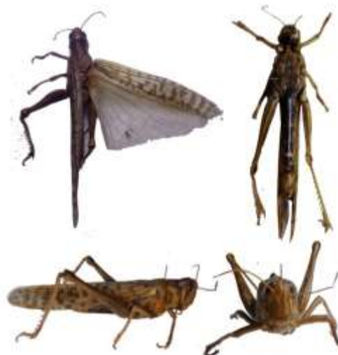
Plate 2. Schistocerca gregaria Female