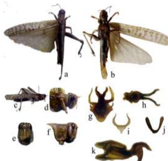
Plate 1. Schistocerca gregaria Male: a. Habitus dorsal view, b. Habitus ventral view c. Habitus lateral view, d,f. Head and pronotum lateral view, e. Head frontal view, g. Phallic complex, i,j. parts of genital plate , k. aedeagus

pod consists of 20-100 eggs, lays 2-3 pods, duration of life cycle depends on the season, summer takes 10 days and winter 65, it takes 5-6 molts in 24 days to reach adult stage (Symmons and Cressman, 2001). The most preferred plants include; pearl millet, phog, cluster bean, jujube, snow bush, mustard tree, bekar grass, watermelon, bhurat (Samejo and Sultana, 2016).