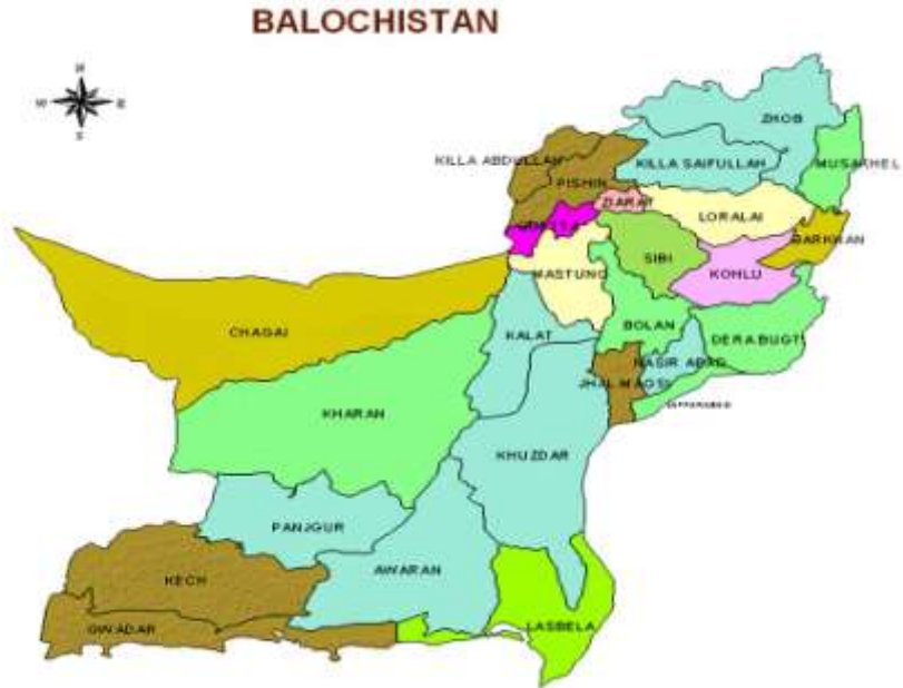
Figure 1. Map of Balochistan showing location of district Killa Saifullah

samples were air-dried ground and passed through 2 mm mesh. Soil samples from each orchard were analyzed for the determination of texture, pH, electrical conductivity ( \text{dS m}^{-1} ), organic matter (%), nitrogen (%), phosphorus ( \text{mg kg}^{-1} ) and potassium ( \text{mg kg}^{-1} ) content.