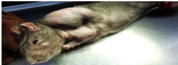
Plate 1. Mass on the lateral thorax of grey rat developed benign tumor on skin

per 10 hpf). There was no evidence of lymphatic or vascular invasion seen. The microscopic examination of rat mass confirmed mammary fibroadenoma (Plate 4) which is known as benign type tumor. Majority of fibroadenoma tumors are benign type tumors and have been seen good prognosis on entire surgical removal. In this case it is reported that successful surgical correction of a thoracic tumor in rat was performed by excision of mass using CO 2 Laser (Luxar). Fibroadenoma is most common mammary tumor of rats occurred in old age (Percy and Barthold, 2007). According to Shafiuza et al. (2010) if such type of tumors not surgically removed in time, it will develop into large size resulting animal will suffer in movement. To control tumor in rodents animal feed should be low fat; calories diet and selection of disease free animal parent are key factors to prevent from fatal tumors. Prognosis was good post-surgery in this case. It is concluded that histopathological findings of rat mass reported here confirm that adult rat has mammary fibroadenoma and section appeared free from tumor cells.