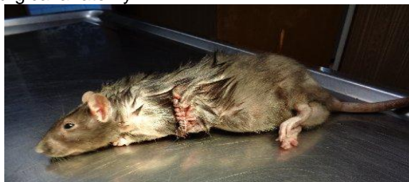
Plate 3. Post-operative view of rat. The mass was surgically removed and wound closed with nylon 4-0 and skin staplers