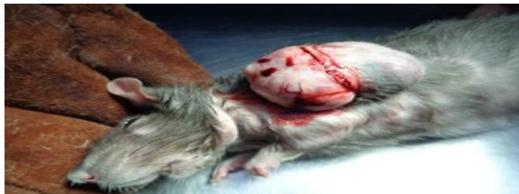
Plate 2. Intra-operative view of mass excised and measuring 4.5x3.5cm, on left thorax of a 3-years old female rat. Note: Drap was removed to showsurgical anatomy.